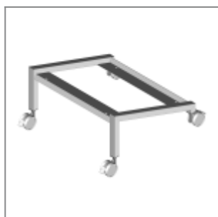
Black painted metal trolley, complete of castors