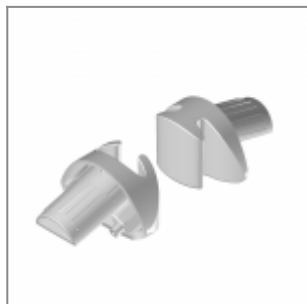
Black plastic UV-resistant 360 KLangley, male and female linking device for Eclipse 4 legs frame without arms