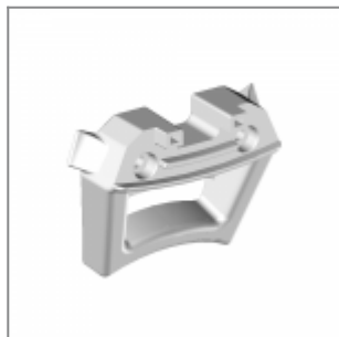
Black plastic UV-resistant 360 KLangley spacer for stacking Eclipse chairs