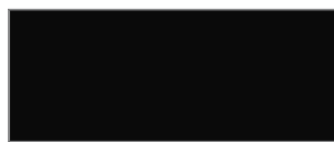
Jet Black - RAL 9005