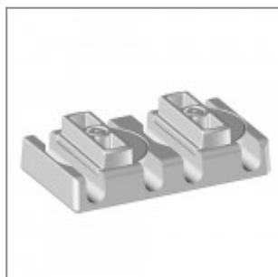
Long linking device w/handle, for Ø11 rod tube chair frames with arms and writing tablet