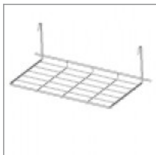
Chrome metal basket for laFilò skid frames