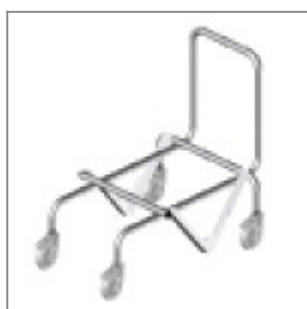
Black painted chair trolley for skid chairs