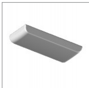
Plastic sliding cap glide for soft and rough surfaces suitable for rod tube frames glides