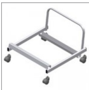
Service trolley for chairs, complete with castors