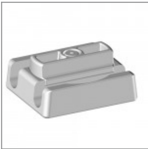
Short linking device w/handle, for Ø11 rod tube chair frames without arms