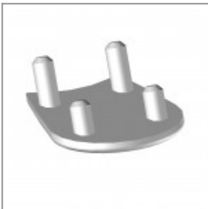
Plastic sliding cap glide for soft and rough surfaces (useful for Flou, laMia and Volée frames)