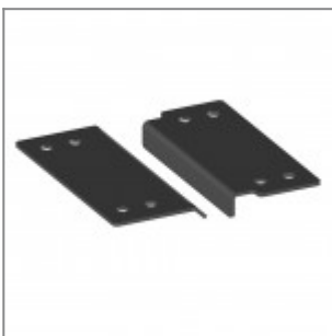
Black painted male and female linking device for Volée arm chairs (2 simple arms or 1 simple arm + 1 arm with writing tablet)