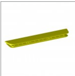
Red plastic arm-pad Volée pantone 201C UV-resistant 300 Klangley