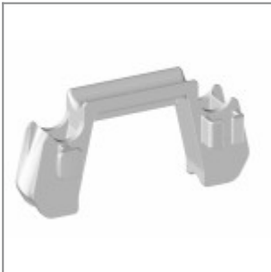
Black plastic spacer / linking device for four legged chairs (2 pcs per chair are needed)