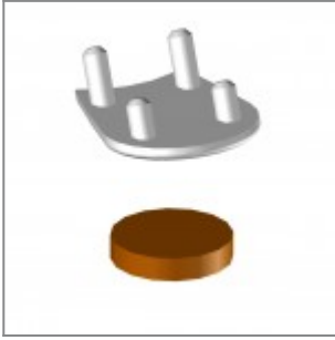
Plastic cap with felt sticker for delicate floor coverings (useful for Flou, laMia and Volée frames)