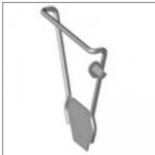
Right handed alum. paint. insert arm for tip-up bench laMia, with pin for writing tablet