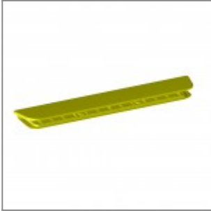
Blue plastic arm-pad Volée pantone 294C UV-resistant 300 Klangley