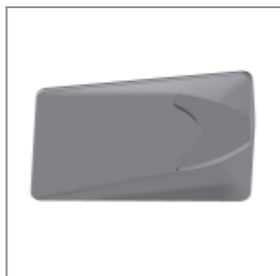
Black plastic writing tablet for right hand people, to be used only with mechanism ZASN30A90