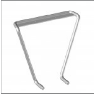
White painted metal insert for Volée arm