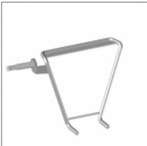
Right handed chromed metal insert Volée with pin for writing tablet