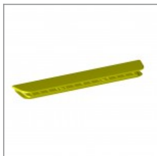
Red plastic arm-pad Volée pantone 201C UV-resistant 300 Klangley