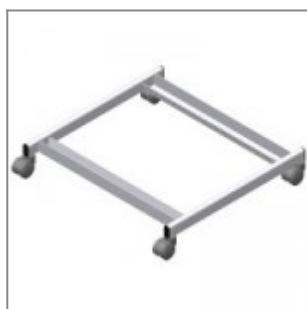
Black painted metal trolley, complete of castors