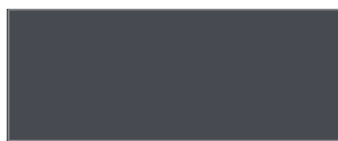
Graphite Grey - RAL 7024