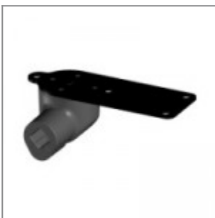
Left-hand antipanic joint for writing tablet modd. ZATV10P90, ZATV10L06