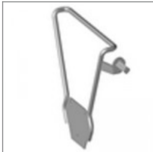
Left handed alum.paint.insert arm for tip-up bench laMia, with pin for writing tablet