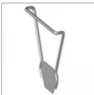
Aluminium painted metal arm insert for tip-up bench laMia