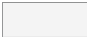
Signal White - RAL 9003