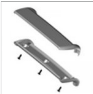
Plastic grey Ral 7040 laMia pad for armrest