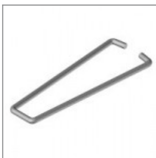
Anti-tilt device for table top with support TZSN30F--