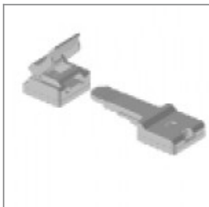
Male+female grey plastic connector for joining and levelling tables (for flip-top tables and LEG with MDF top)