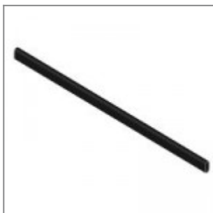
Release bar for top table 1200/1800mm