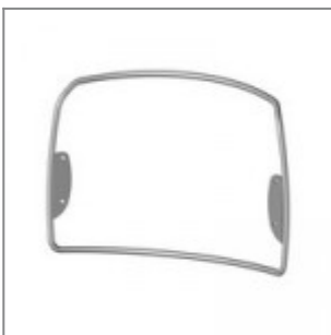
Alina back metal frame for mesh