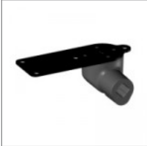
Right-hand antipanic joint for writing tablet modd. ZATV10P90, ZATV10L06