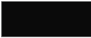
Jet Black - RAL 9005