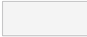
Signal White - RAL 9003