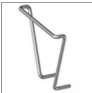
Chromed metal insert for laMia armrest