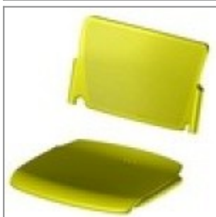
Red Pantone 201C laMia seat and back polypropylene UV-resistant 360 Klangley