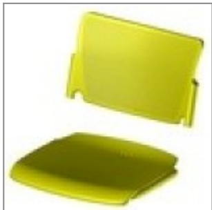
Sand laMia seat and back polypropylene UV-resistant 360 Klangley