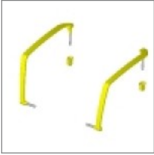
Black plastic pair of Multi arms