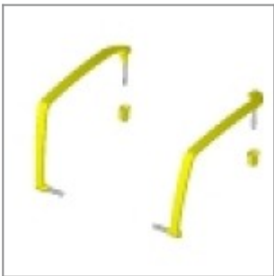
White plastic pair of Multi arms