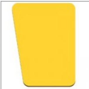
Left-hand varnished beech wood writing tablet, suitable with joint cod. ZST15M