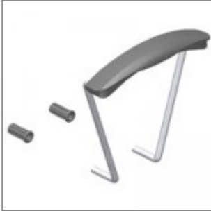
Aluminium painted arm Flou with ABS arm-rest