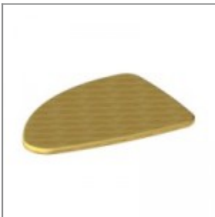
Left/Right-hand antipanic writing tablet in varnished beech, suitable with ZASN10P90, ZASN20P90