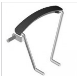
Flou chromed arm with ABS arm-rest for writing tablet, left facing the chair