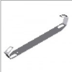
Black painted spacer bar for laKendò chairs (screws not included)