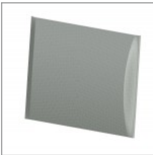
White fire retardant mesh back for S'mesh