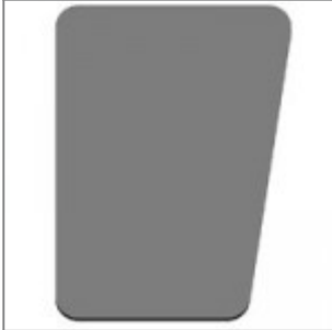
Black PS writing tablet, right-hand, suitable with joint cod. ZST15M