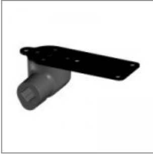
Left-hand antipanic joint for writing tablet modd. ZATV10P90, ZATV10L06