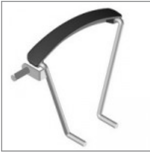
Flou chromed arm with ABS arm-rest for writing tablet, left facing the chair