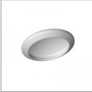
Grey cover for Hilo/Clipper screws