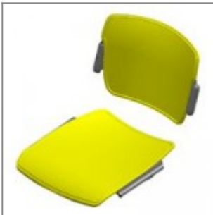
Flou seat and back in red PP colour