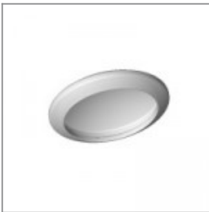
Grey cover for Hilo/Clipper screws