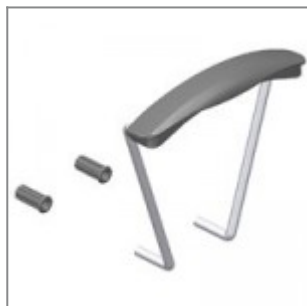
Aluminium painted arm Flou with ABS arm-rest