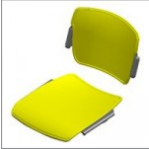
Flou seat and back in red PP colour