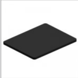
Table top for bench 450x500, bicoloured black and grey