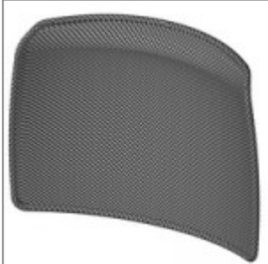
Alina back metal frame with black mesh