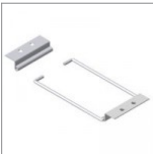
Long liking device for 2 arms chair and writing tablet