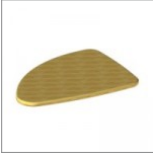
Left/Right-hand antipanic writing tablet in varnished beech, suitable with ZASN10P90, ZASN20P90