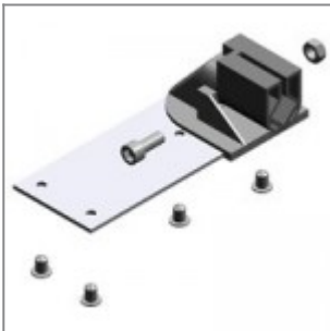
Nylon joint with fixing metal plate for writing tablet modd. ZTF2635, ZTF2635DX, ZTP2635