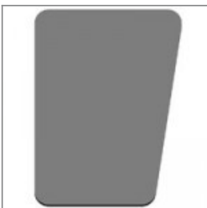
Black PS writing tablet, right-hand, suitable with joint cod. ZST15M