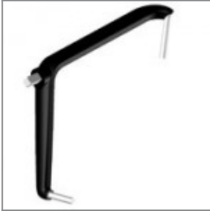
Left polyurethane arm Alina for writing tablet, facing the chair