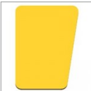
Right-hand varnished beech wood writing tablet, suitable with joint cod. ZST15M