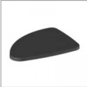
Left/Right-hand antipanic writing tablet in black ABS, suitable with ZASN10P90, ZASN20P90