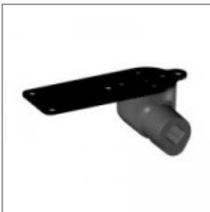
Right-hand antipanic joint for writing tablet modd. ZATV10P90, ZATV10L06