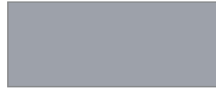
Window Grey - RAL 7040