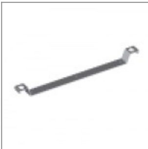
Black spacer for chairs, accessories not included