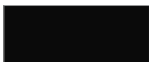
Jet Black - RAL 9005