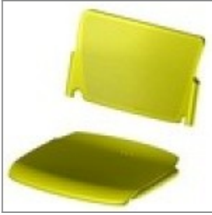
Sand laMia seat and back polypropylene UV-resistant 360 Klangley