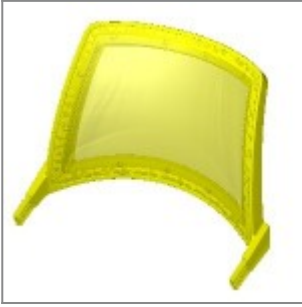
Grey back laKendò with grey mesh assembled