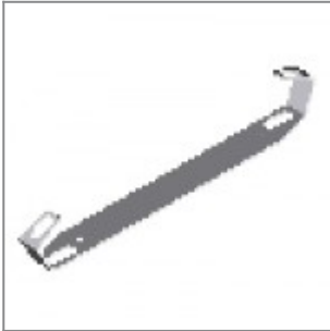
Black painted spacer bar for laKendò chairs (screws not included)