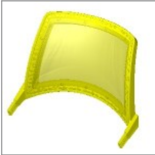
Black back laKendò with black mesh assembled