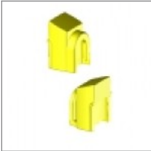
Black plastic male and female linking device for armless laKendò chair