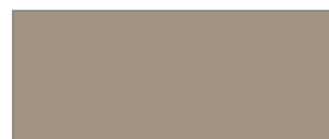
Pantone - 7530C