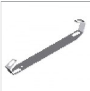
Black painted spacer bar for laKendò chairs (screws not included)