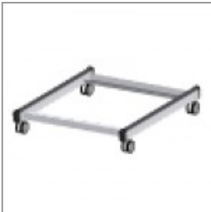
laKendò black painted chair trolley with castors