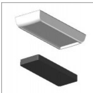
Plastic cap with felt sticker for delicate floor coverings suitable for rod tube frames glides